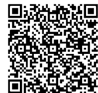
QR Code for Event

Prof. James J. Heckman, the 2000 Nobel Laureate in Economic Sciences, delivered a Distinguished Lecture entitled "Life-Relevant Skills" on 6 October 2016 at CUHK.